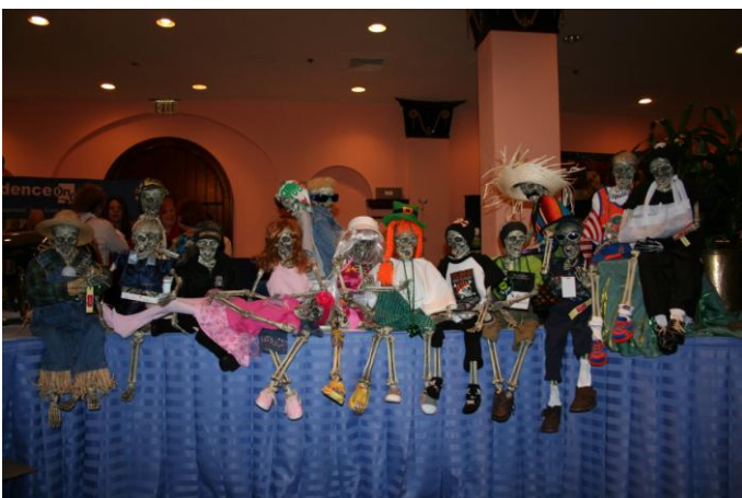
2011 Conference..... Thank you Medtech Forensics, Inc.